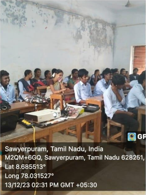
Sawyerpuram, Tamil Nadu, India M2QM+6GQ, Sawyerpuram, Tamil Nadu 628251, Lat 8.685513° Long 78.031527° 13/12/23 02:31 PM GMT +05:30