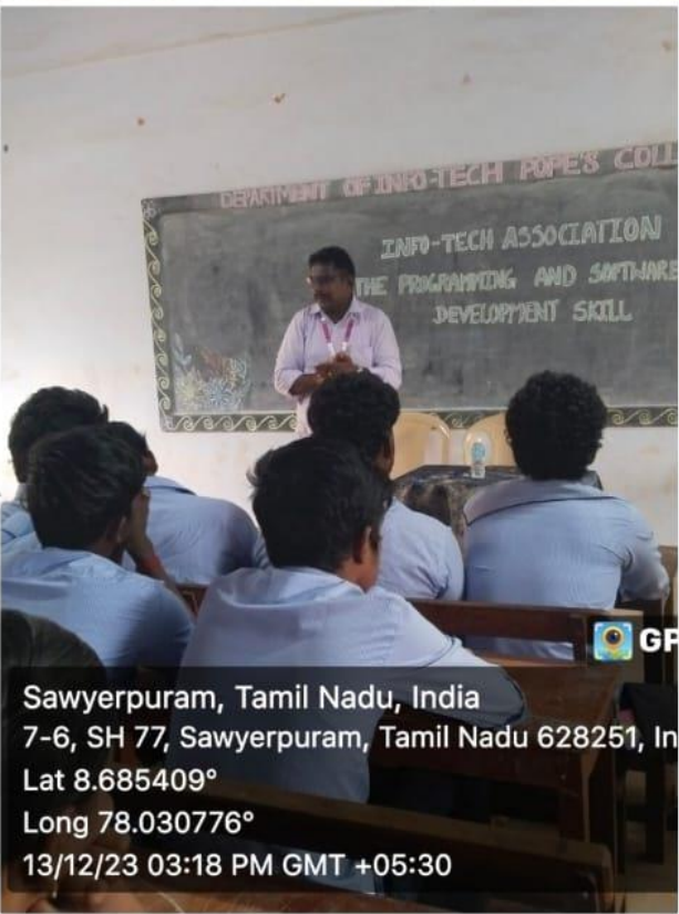
Sawyerpuram, Tamil Nadu, India 7-6, SH 77, Sawyerpuram, Tamil Nadu 628251, In Lat 8.685409° Long 78.030776° 13/12/23 03:18 PM GMT +05:30