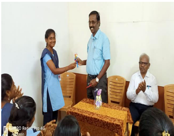
Greeting the resource person